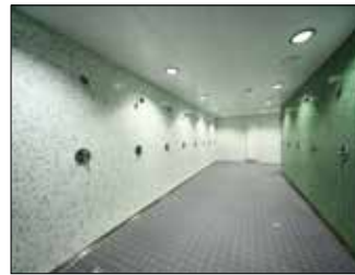
Schools & Dormitories