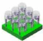
Dual In-Line Package (DIP)